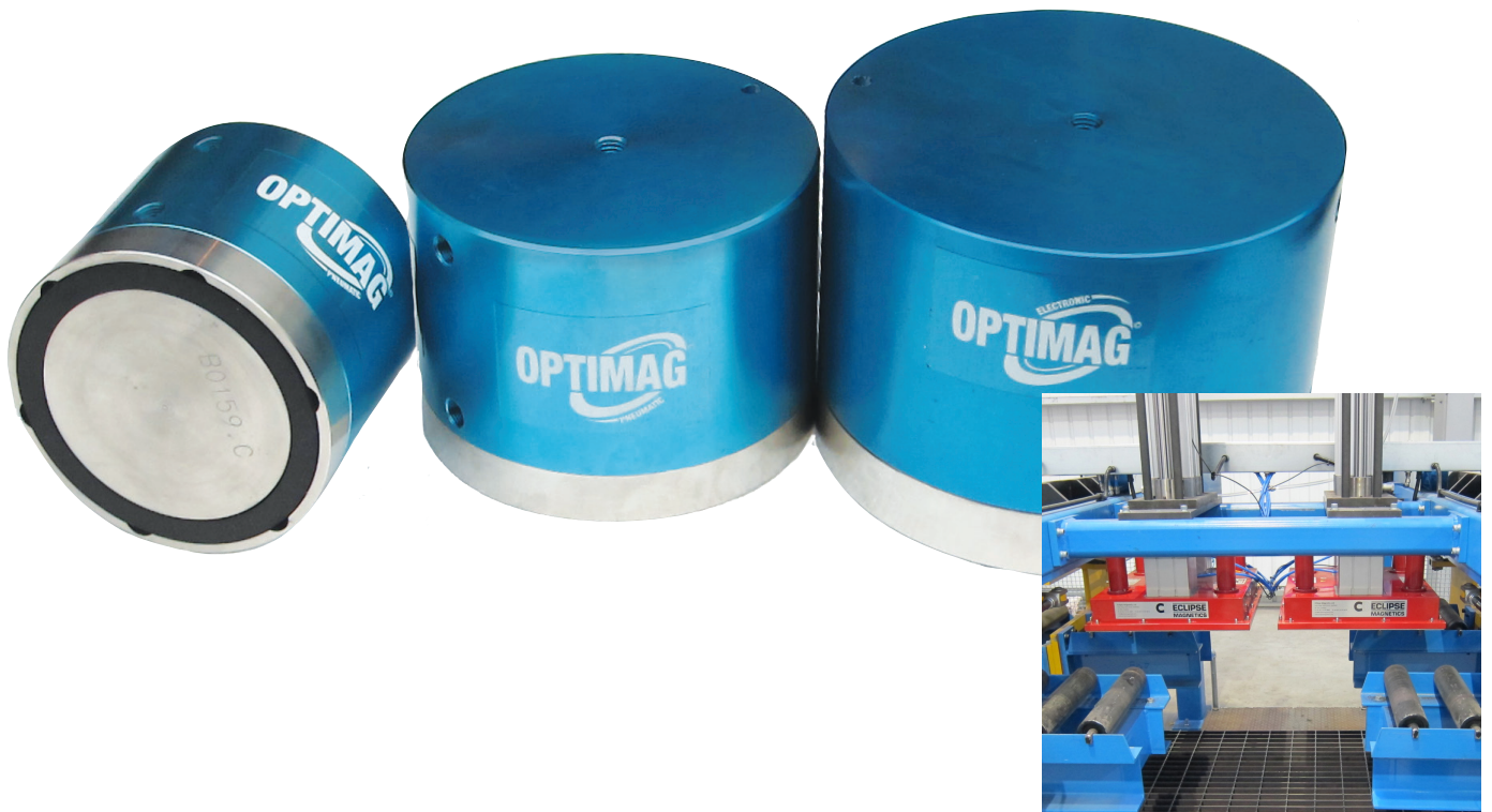
Rectangular Optimag P

Pneumatically switched permanent magnetic lifter