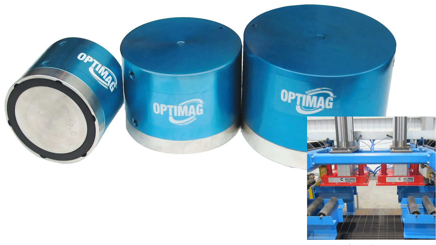
Rectangular Optimag P

Pneumatically switched permanent magnetic lifter