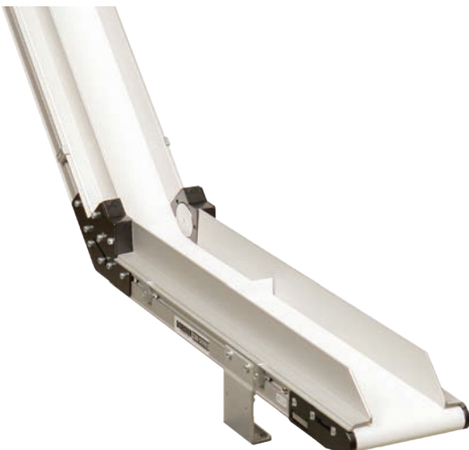
Horizontal to Incline