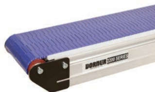
Micropitch Closed Mesh