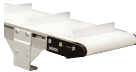
Flat Belt Cleated