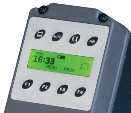
Built-in quartz controlled timer with LCD display