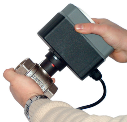
Should there be an electrical power failure, then the ball valve can be manually opened or closed.