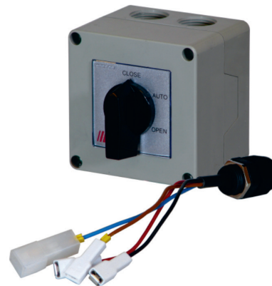
Remote control option.