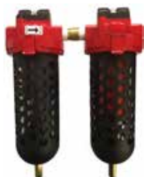
Polycarbonate Bowl Model 3P-060-PP4-DCI

The Eliminizer Combo incorporates the clean, dry air of the Eliminizer with a high efficiency borosilicate coalescer. This multi stage unit is designed for water and dirt removal in the first stage and oil aerosol removal to 0.01 micron in the second stage.