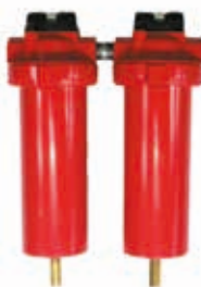
Stainless Steel Bowl Model 3P-060-SP4-DC

The Eliminizer Combo is available with polycarbonate, metal or stainless steel bowls with connections from 1/4" to 1" and can handle flows up to 150 SCFM.