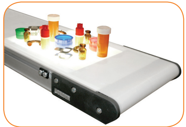
Ideal for a variety of products