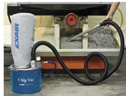
The Mini Chip Vac allows for easy clean up of small messes.