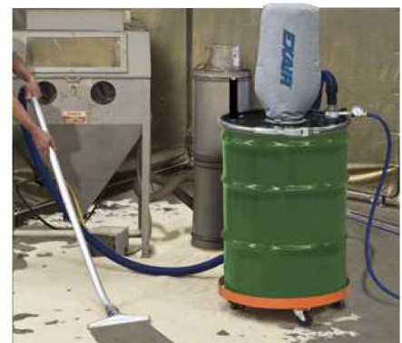
Sand that covers the floor around a sand blaster is quickly vacuumed into the drum using the rugged floor tool.