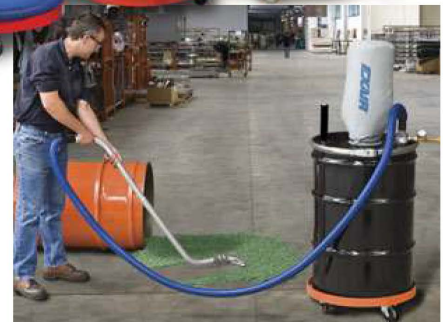
The Heavy Duty Dry Vac cleans up a spill of tumbling media.