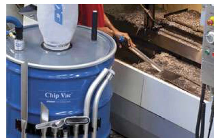
110 Gallon Chip Vac offers maximum capacity cleanup on a large machining operation.

The Chip Vac Systems include a drum lid with a locking ring that fits an open top drum. In less than a minute, the Chip Vac can be removed and easily placed onto another drum to keep different materials separate for recycling. Constant heavy lifting and dumping of the vacuum cleaner tanks is eliminated since all chips are vacuumed directly into the drum.