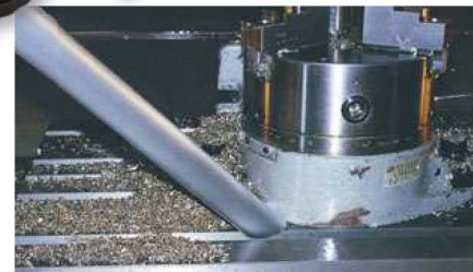
The Chip Vac removes abrasive stainless steel chips from a CNC.

The compressed air operated Chip Vac is an industrial duty vacuum designed specifically for vacuuming chips. It creates a powerful direct flow action that vacuums metal, wood or plastic chips into an ordinary drum. Designed for occasional use with dusty materials, the included filter bag keeps the surrounding air clean.