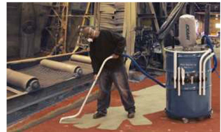
110 Gallon Heavy Duty Dry Vac provides maximum capacity cleanup for a large, dusty walnut shell blasting application.