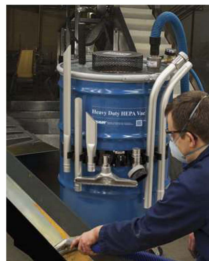
A technician uses a Heavy Duty HEPA Vac to perform scheduled maintenance on a pulverizer.