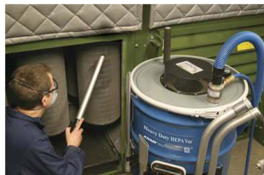
A clogged filtering system for a buffing booth is quickly cleaned and put back into service using the Heavy Duty HEPA Vac.

The Heavy Duty HEPA Vac does not use electricity and has no moving parts, assuring maintenance free operation. This eliminates the risk of electric shock often associated with electric shop vacs. Static resistant hose prevents painful shocks when vacuuming dry, dusty materials.