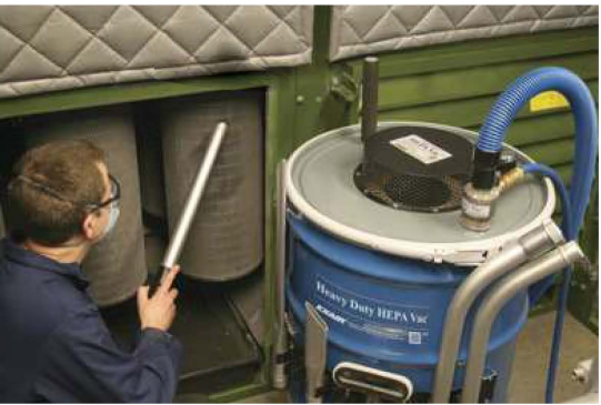
A clogged filtering system for a buffing booth is quickly cleaned and put back into service using the Heavy Duty HEPA Vac.