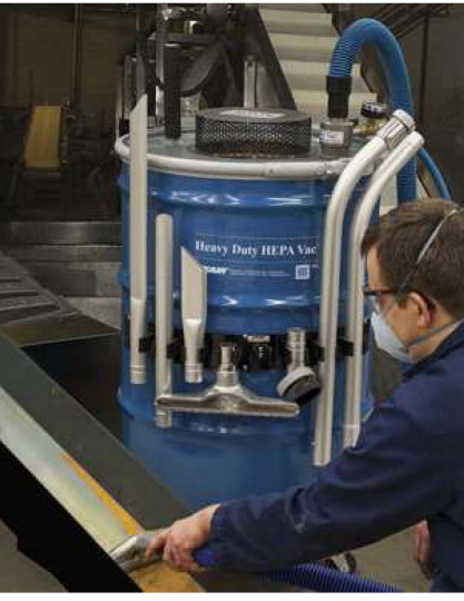
A technician uses a Heavy Duty HEPA Vac to perform scheduled maintenance on a pulverizer.