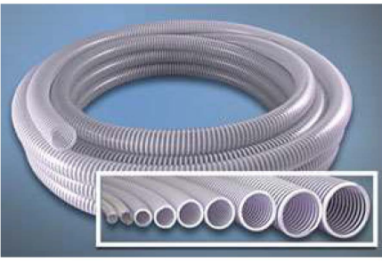
PVC hose is available in lengths up to 50' (15.2m) and diameters up to 3" (76mm).