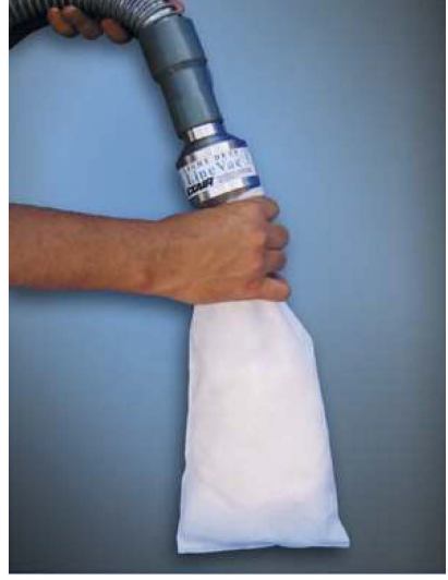
The low cost Model 130200 2" (51mm) Light Duty Line Vac conveys fibers to fill pillows, stuffed animals, diapers, etc.