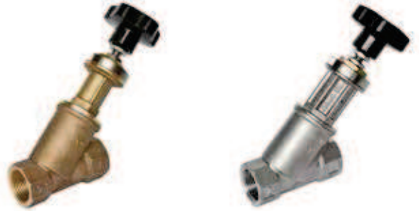
TYPE: CG manual