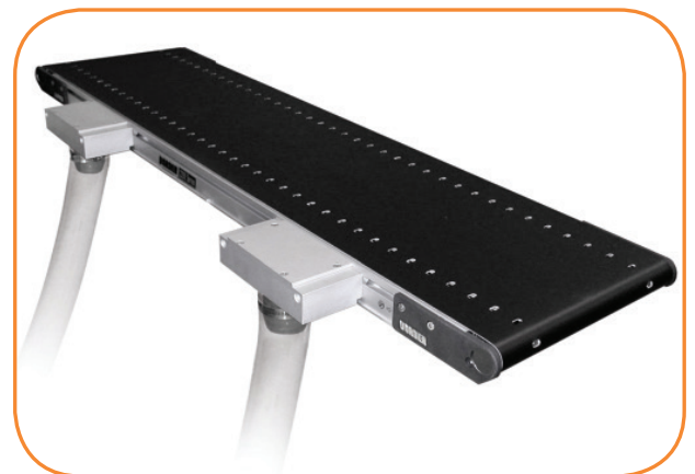
Can be Used with a Variety of Vacuum Sources