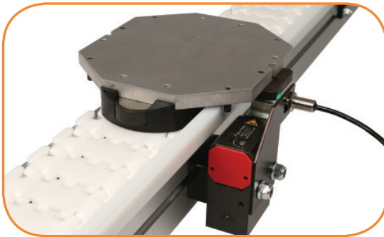
Cushioned Pallet Stop