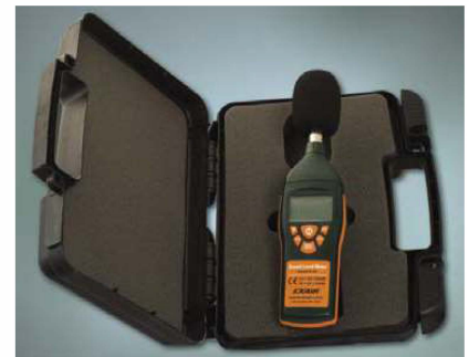
Model 9104 Digital Sound Level Meter comes complete with removable wind screen, battery and a protective case.