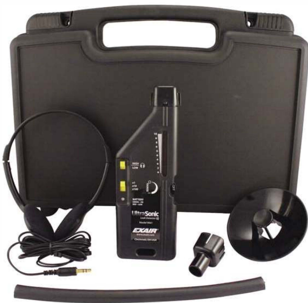
The Model 9061 Ultrasonic Leak Detector comes complete with a hard-shell plastic case, headphones, parabola, tubular adaptor, tubular extension and 9 volt battery.

In some cases, the suspected leak is in a hot area and/or close to moving parts. The tubular extension and parabola make it possible to probe these difficult locations from a distance to isolate the leak.