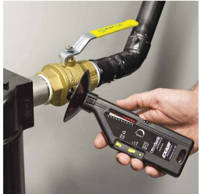
The Model 9061 Ultrasonic Leak Detector quickly pinpoints a costly leak in a noisy industrial environment.

Ultrasound is directional in transmission and is loudest at the source. Turbulence created by the air forced through a small orifice generates ultrasonic sound. This emitted sound is called “white noise” and occurs when the air moves from a high pressure area such as a pipe or vessel and escapes to a low pressure area such as the room. The Ultrasonic Leak Detector converts the turbulent flow to a frequency that can be heard using the headphones. As the ULD moves closer to the leak, more LEDs on the display light to confirm the source of the leak.