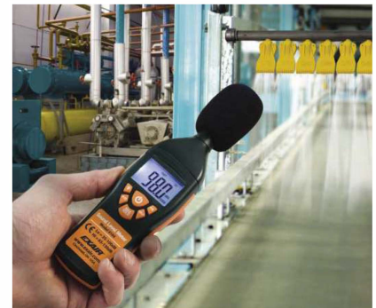
The Sound Level Meter identifies a potential source of hearing loss.